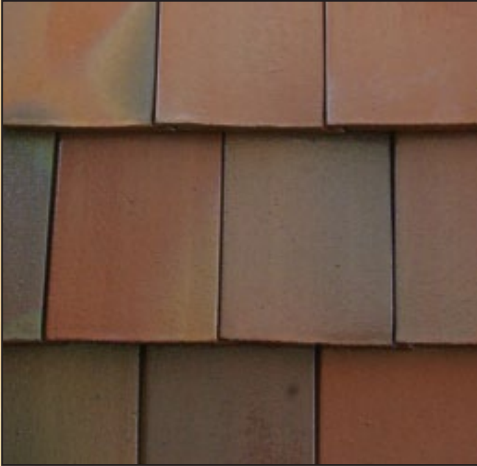
Kiln-Run #8 Mix